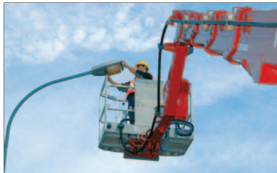
Scanreco in action.

The Mini control unit can also be provided with 2 or 3 joysticks at a universal and variable speed with X/Y-axis or with Z-axis (2-0-2 / 2-2-2 / 2-3-2 / 3-2-3).