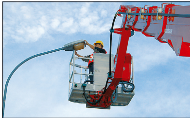
Scanreco in action.

The Mini control unit can also be provided with 2 or 3 joysticks at a universal and variable speed with X/Y-axis or with Z-axis (2-0-2 / 2-2-2 / 2-3-2 / 3-2-3).